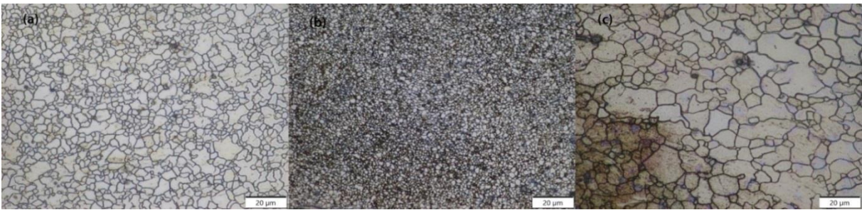
Fig. 18. Microstructures of Friction Stir Welded Joints: (a) 750 rpm, 10 mm/min, 15 mm, (b) 825 rpm, 15 mm/min, 18 mm, and (c) 900 rpm, 20 mm/min, 20 mm